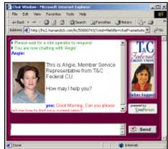
Secure Live Chat

The service is live during your normal business hours and gives you one more way to increase the level of service you provide your members — by reaching them the way they choose. After hours, your members can use the feature to send e-mails with their questions for the MSRs to respond to the next day.